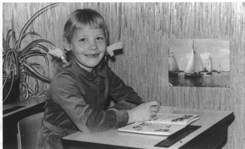
1967 [?] Waddinxveen.