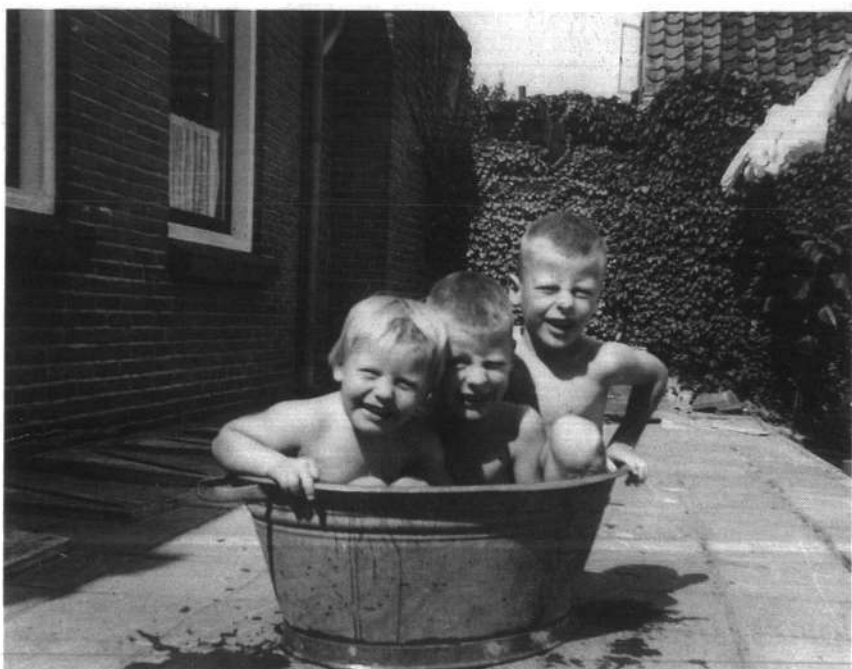
1963 [?] Nieuw- en St. Joosland.